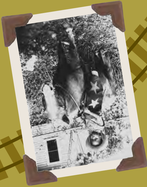
Winter Park, Florida